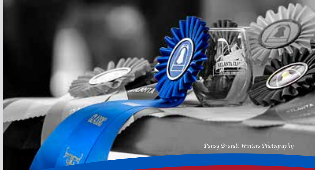
Pansy Brandt Winters Photography

The new network for displaying and socializing about your awards