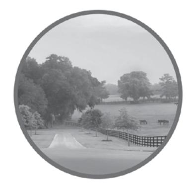
UNITED STATES EQUESTRIAN FEDERATION

C Rated: Adult Amateur Hunter, Children's Hunter, Children's Hunter Pony, Pre-Green Hunter